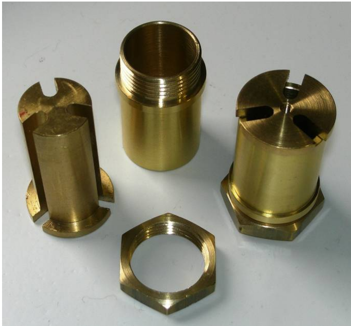
3 couples fiber optics feedthrough for 18GHz cut-off frequency