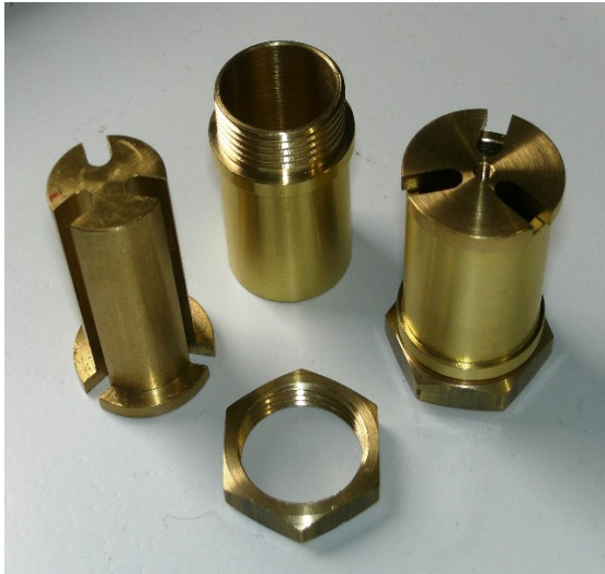
Fiber optic waveguide 18GHz

Any GTEM are supplied with a standard 3 pairs fiber optic feedthrough with 18GHz cut-off frequency. Bigger feedthrough are available with cut-off frequency 8GHz.